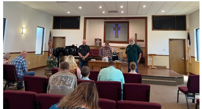
FBC Castor observes the ordinance of the Lord's Supper.