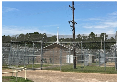
Pastor's Prison Ministry Training at the Missions & Ministry Center.