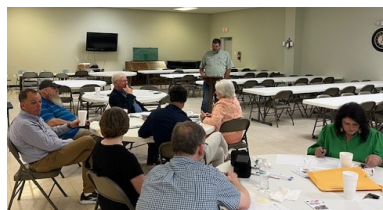
Webster-Claiborne Ex. Board Mtg @ Calvary, Homer.