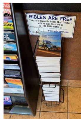
Above, Bible distribution at Gap Farms.