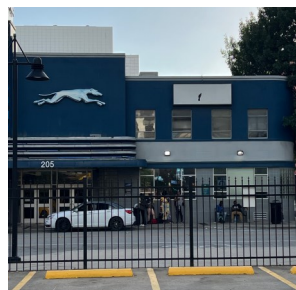
Bible Distribution Point Downtown Dallas.