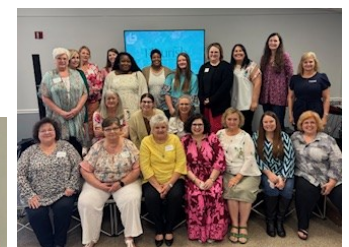
2025 Ministry Assistants Conference at North Acres BC.