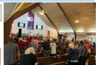
Above, Calvary BC, Homer Revival.