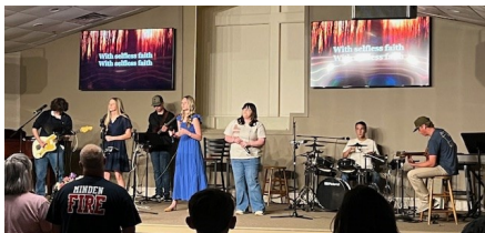
Left, North Acres Youth Band

Sowing The Seeds Of The Gospel... At Home, In Our State, To Our Nation, And to the Ends of the Earth Acts 1:8