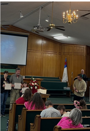
Webster-Claiborne Executive Board Meeting Feb. 18th.

Sowing The Seeds Of The Gospel... At Home, In Our State, To Our Nation, And to the Ends of the Earth Acts 1:8