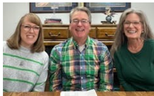
Rolling Hills Board Meeting

We are praying for each of you. It is a joy to serve you!