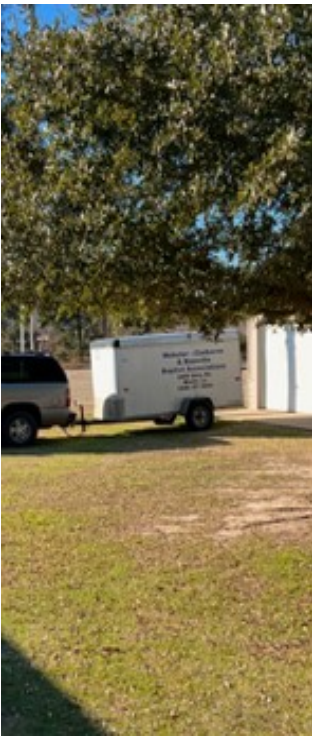
Backed up and ready to serve!!

Sowing The Seeds Of The Gospel... At Home, In Our State, To Our Nation, And to the Ends of the Earth Acts 1:8