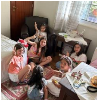
Iraqi House Church

sions, the Annie Armstrong offering that supports North American Missions, and the Lottie Moon offering that supports International missions are vital to mission funding providing over half of their budgets. Lead your church to raise your goals giving more than you ever have. Our world needs the Gospel to survive. Also, while you are thinking of missions elsewhere, don't neglect your local missions. Our association needs your support. The needs at Camp Harris, Baptist Student Ministries at Tech, Rolling Hills, Granberry Counseling grow every year. We need your support to do our work. I ask that you pray about your mission giving and increase your giving this year. Thank you for your past generosity. Thank you in advance for your future generosity as well.