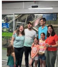
Welcomed new missionaries

Cooperative Program still provides the backbone of our mission efforts providing about 50% of SBC mission funding. The Georgia Barnette offering that supports Louisiana mis-