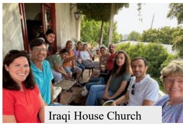
Iraqi House Church

most are secular, with no real religious background. Many will say they are Catholic, but only the old folks still attend worship, the younger generations have become agnostic and uncaring of spiritual things.