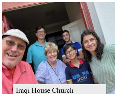
Iraqi House Church

Our association needs your support. The needs at Camp Harris, Baptist Student Ministries at Tech, Rolling Hills, Granberry Counseling grow every year. We need your support to do our work. I ask that you pray about your mission giving and increase your giving this year. Thank you for your past generosity. Thank you in advance for your future generosity as well.