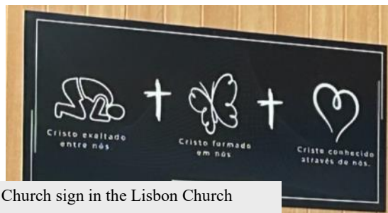
Church sign in the Lisbon Church